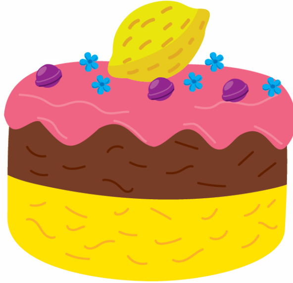
A Birthday Cake

Describe the picture. Write about 20 words.